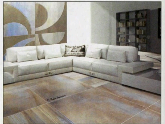
Bottom right: Confetti by Ceramica Vogue.